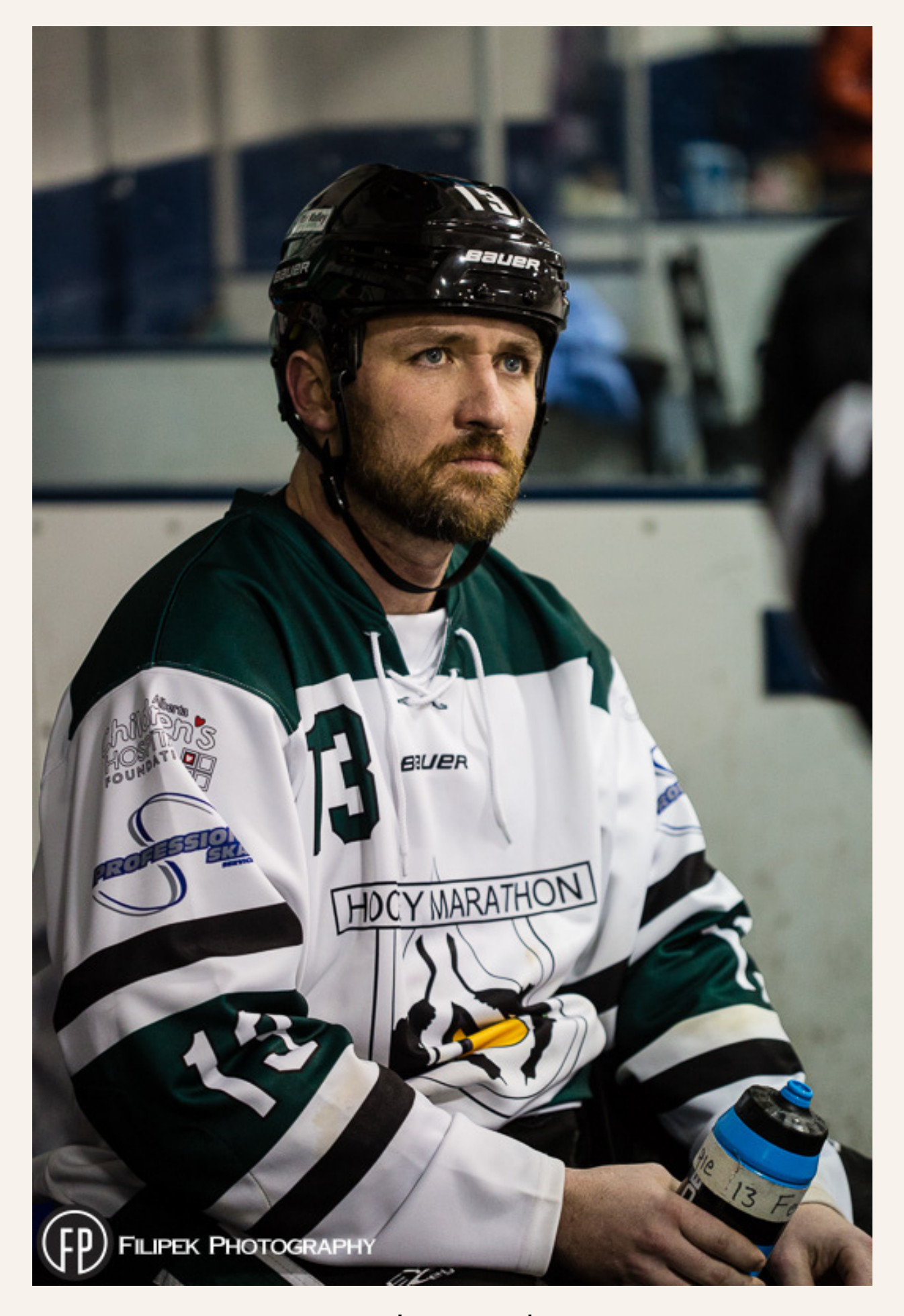
Caption this photo:)